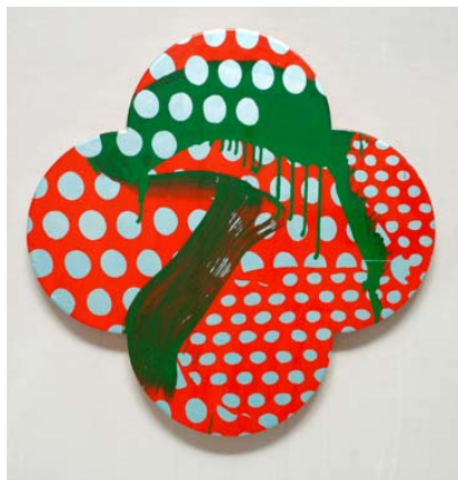
image: Max Gimblett, On A Clear Day , 2010, from The Word of God: Max Gimblett The Sound of One Hand exhibition