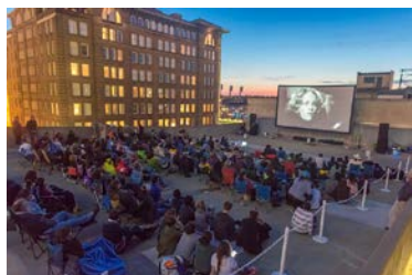
Image: Pittsburgh Downtown Partnership's Rooftop Shindig