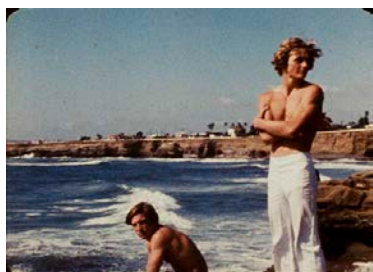
Image: Andy Warhol, San Diego Surf , 1968/1996, © 2017 The Andy Warhol Museum, Pittsburgh, PA, a museum of Carnegie Institute. All rights reserved.