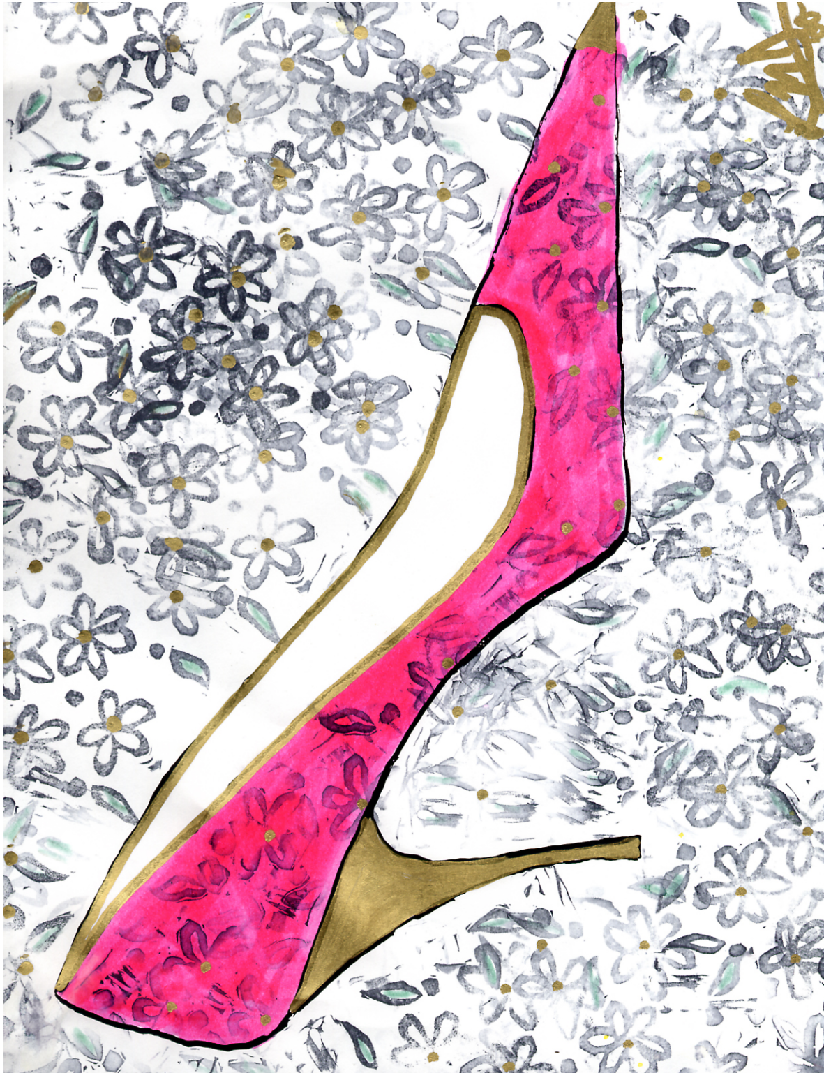
Student example of a rubber stamped shoe illustration.