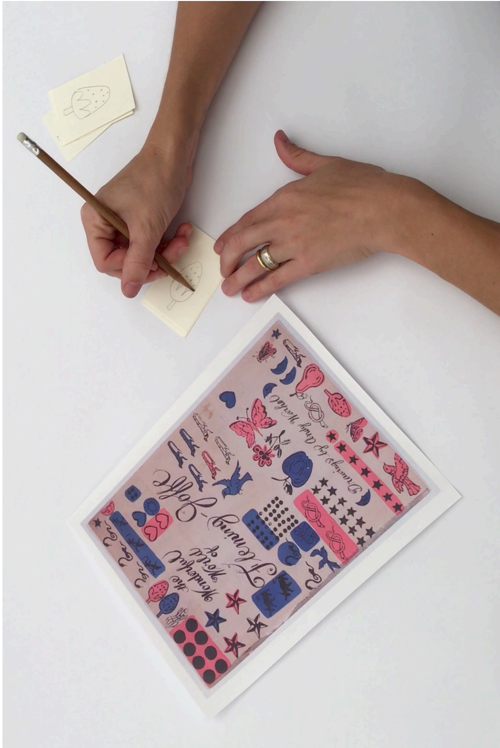
Source image of designs from Andy Warhol's early commercial work.

© The Andy Warhol Museum, one of the four Carnegie Museums of Pittsburgh. All rights reserved.