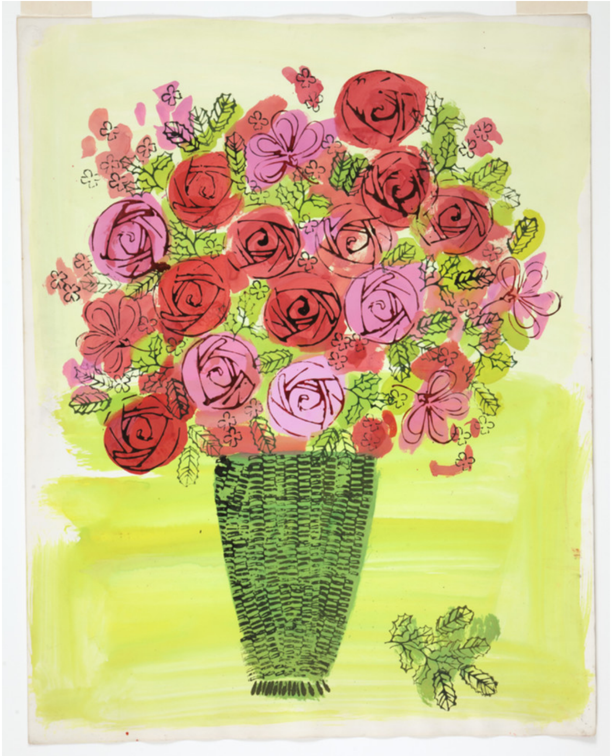
Andy Warhol, ( Stamped ) Basket of Flowers , ca. 1961, © AWF