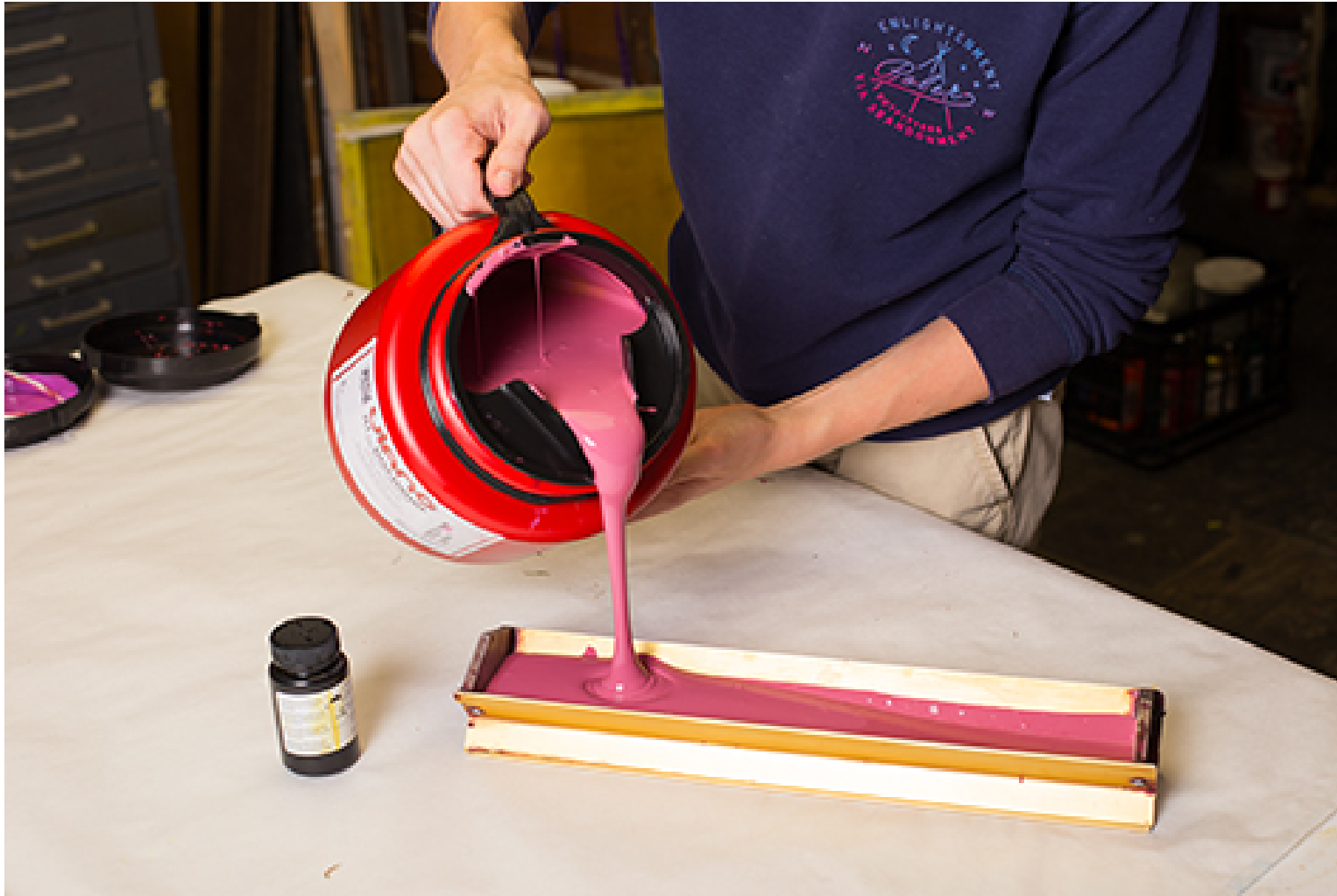
A student pours photo emulsion into a scoop coater.