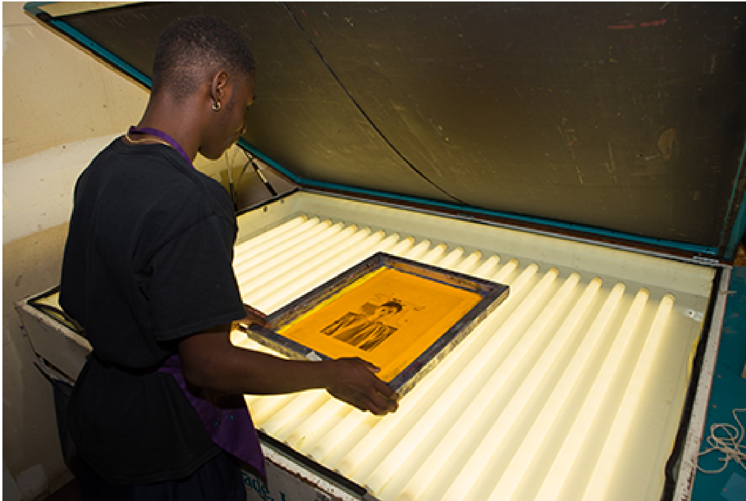
A student exposing a film positive onto a coated silkscreen on a light table.