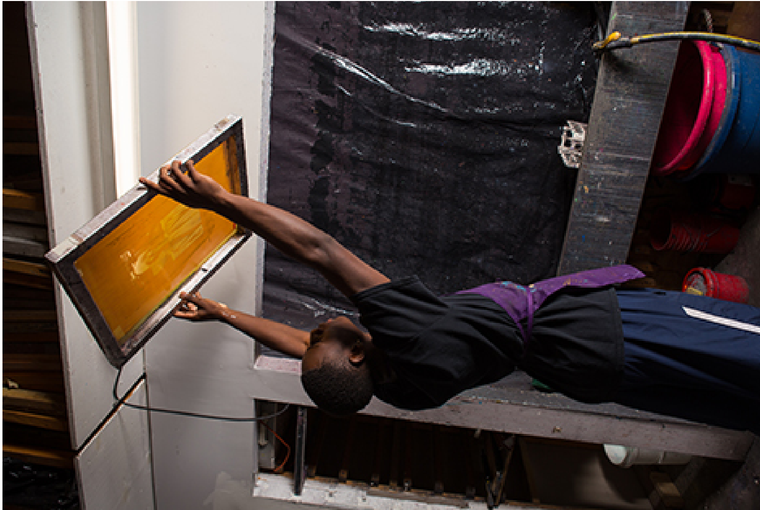
A student checks a silkscreen to see if it is properly cleaned.