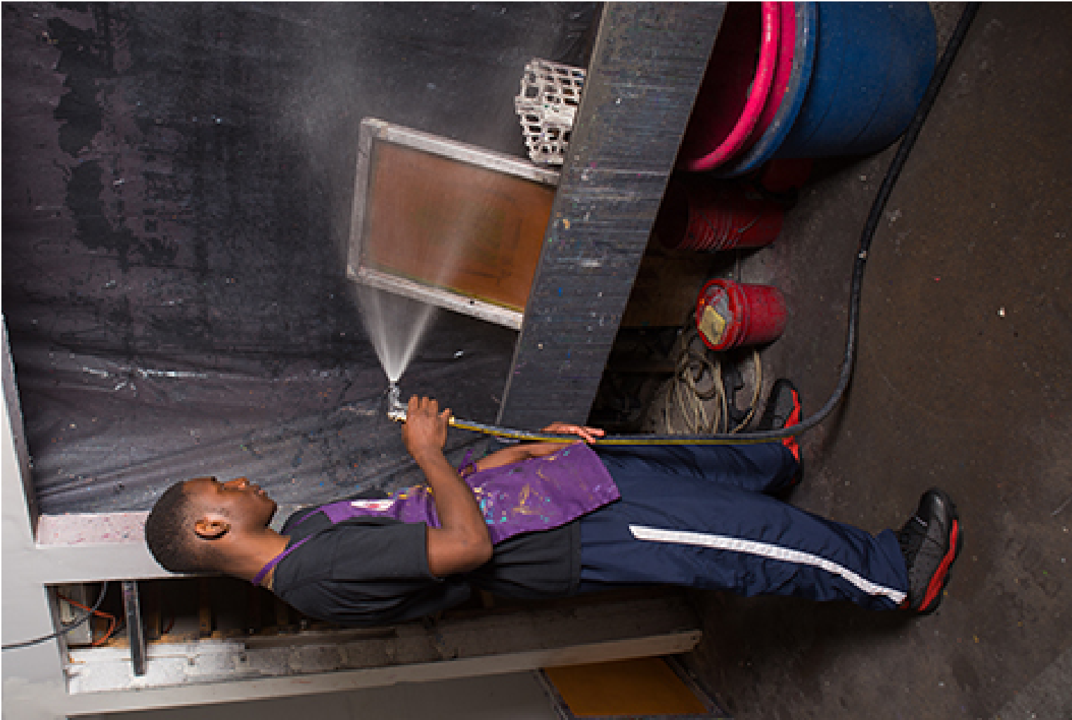
A student washes the emulsion out of the exposed silkscreen.