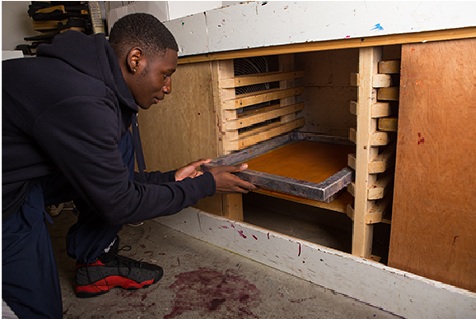
A student places the coated silkscreen underneath a wooden cabinet.