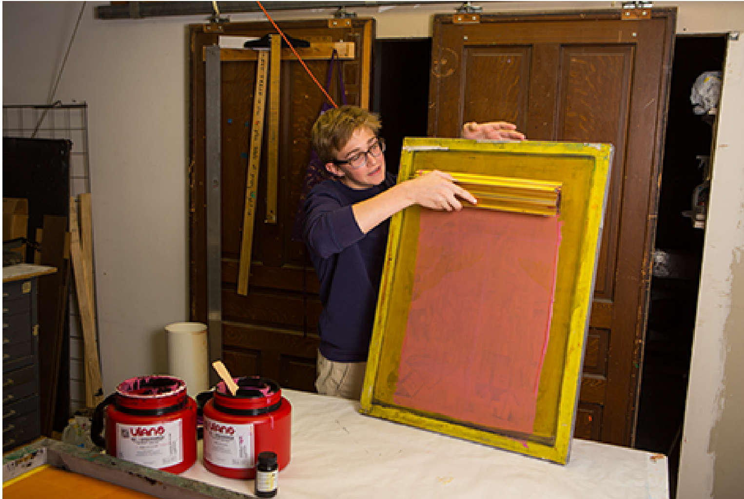
A student pulls a scoop coater across the screen to coat it.