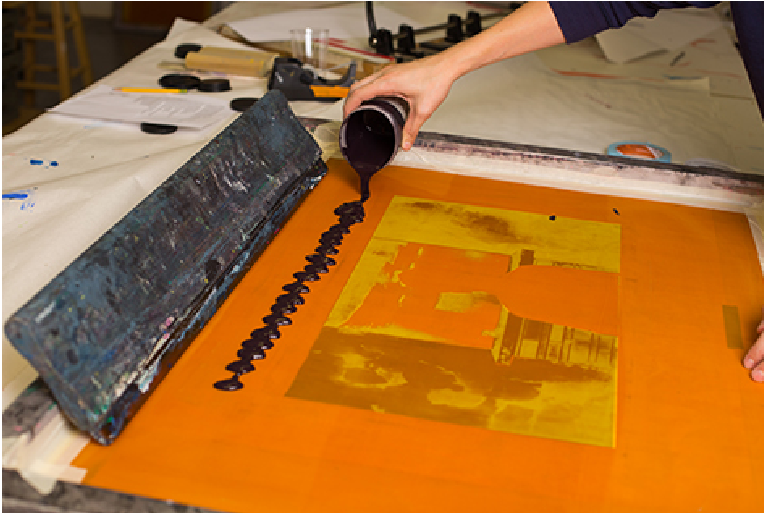
A student printing his final photographic silkscreen layer in black ink.