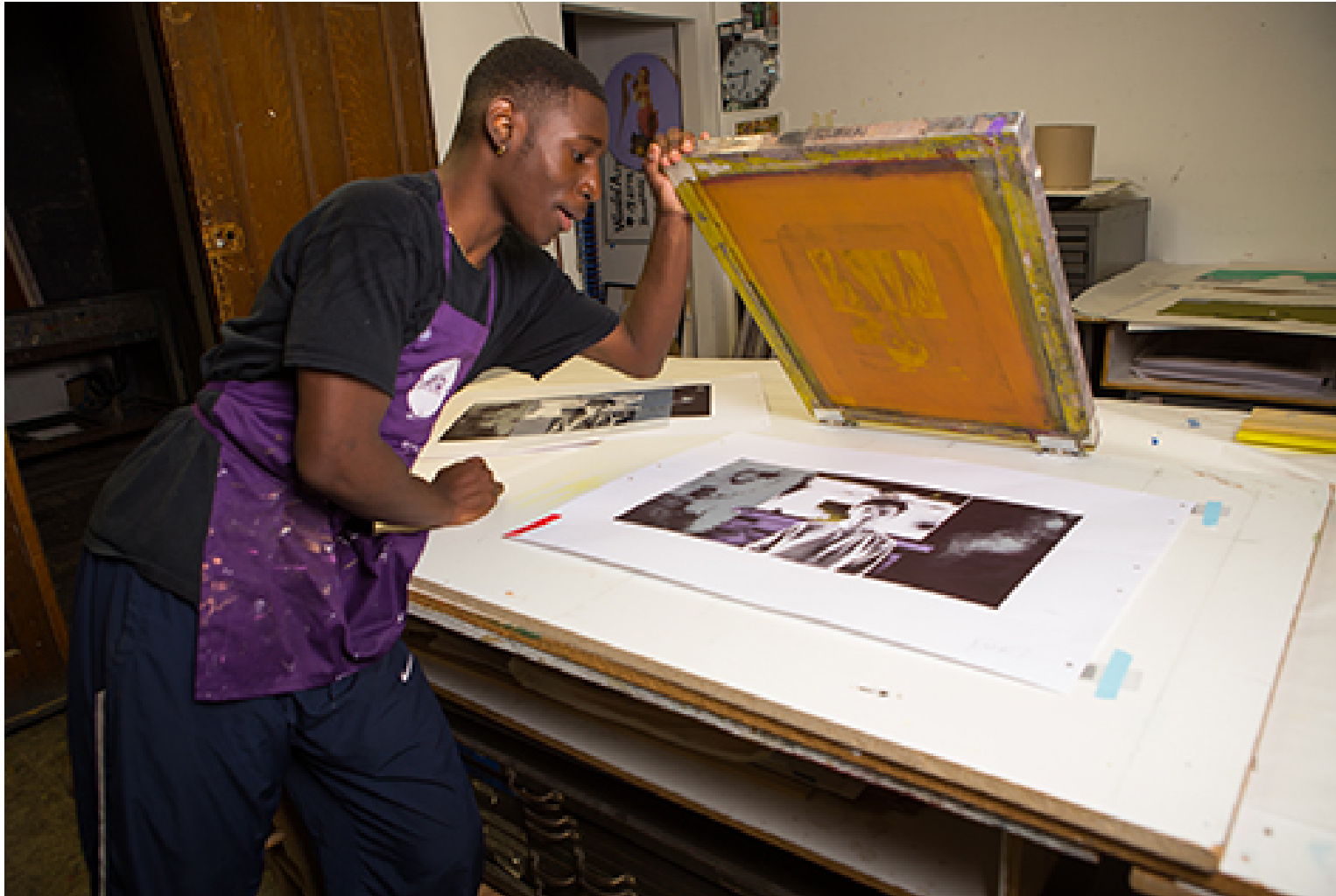
A student checking his final printed layer.