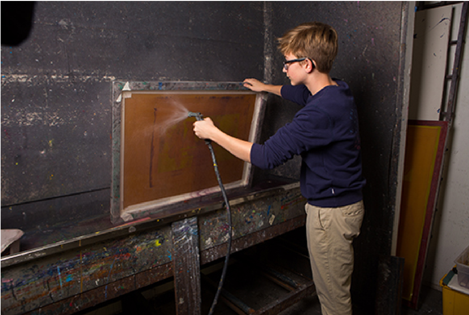
A student washing out a silkscreen after printing.