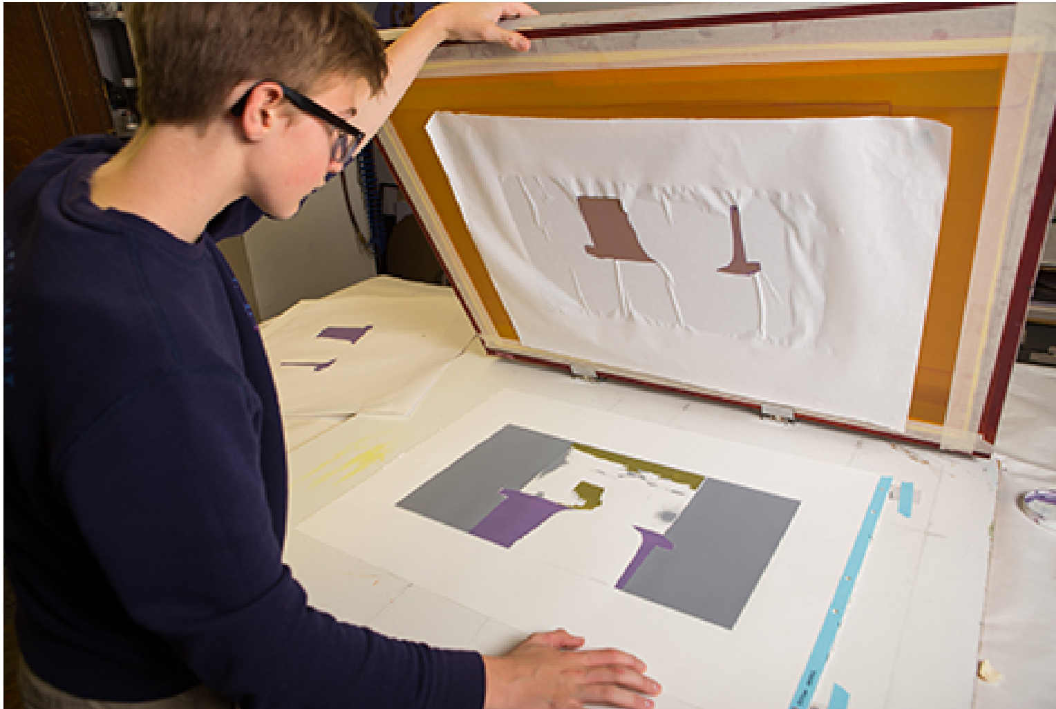
A student lifting silkscreen after printing with stencil.