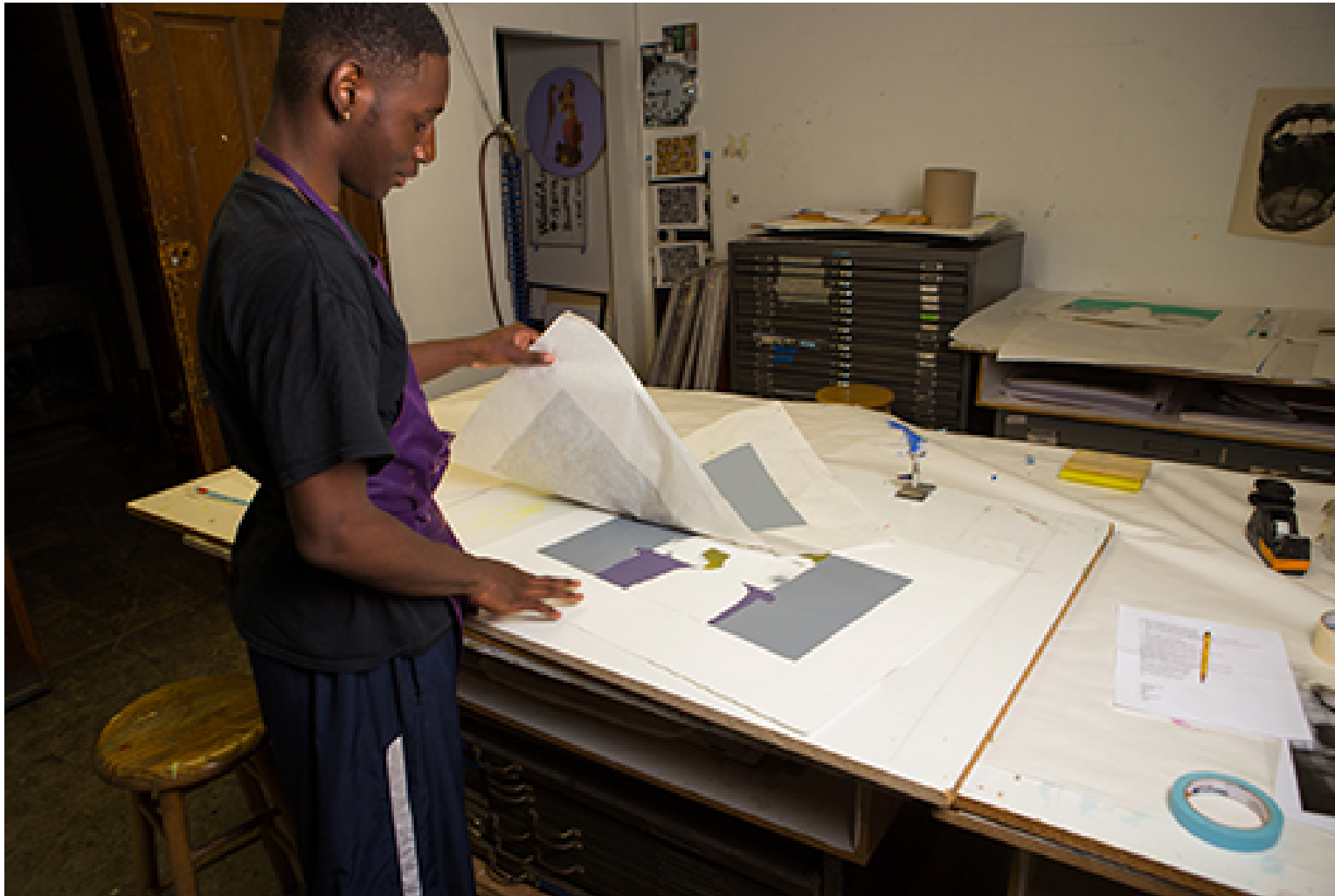
A student putting an additional stencil layer to his print.