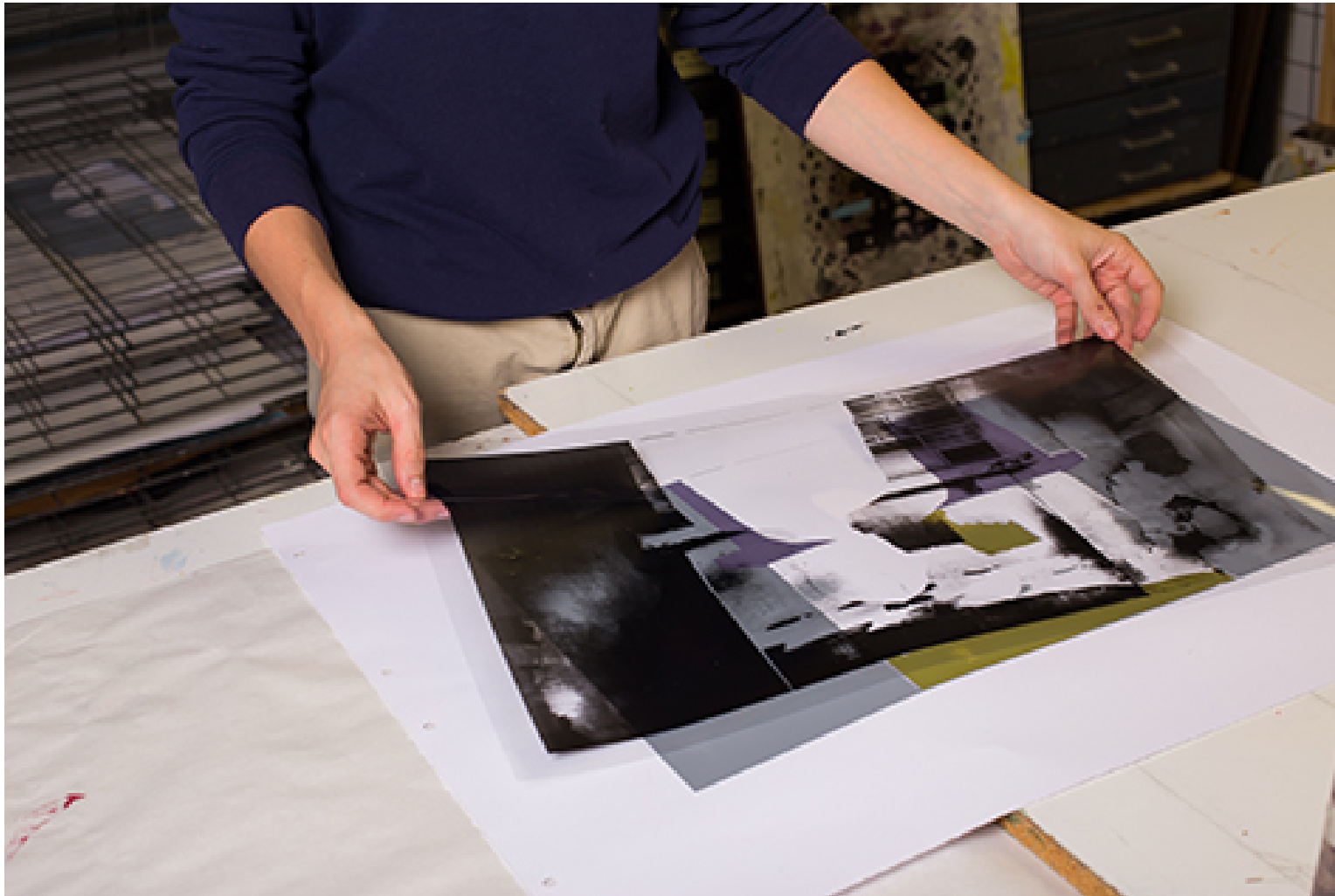
A student checking his film positive over his multiple layers.