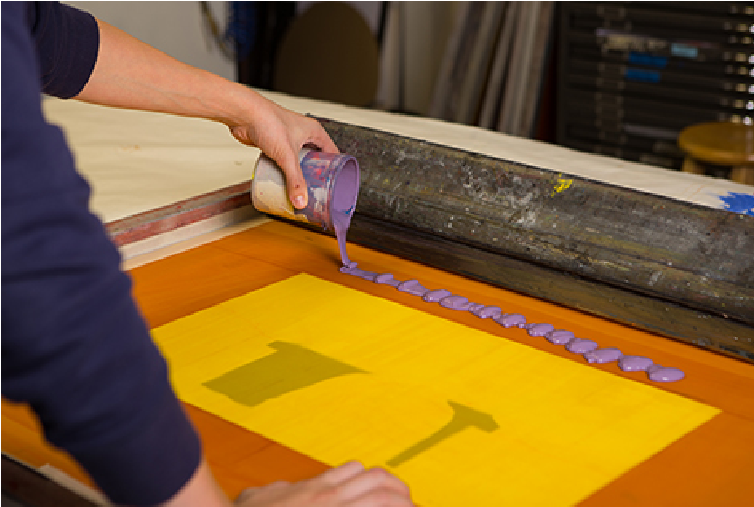
A student pours ink onto the silkscreen.