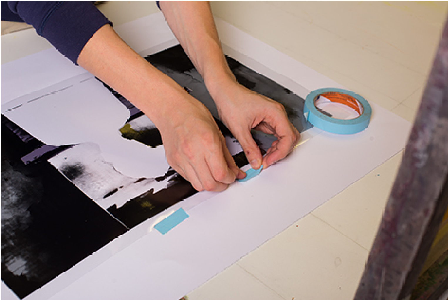
A student using tape to line up and register a stencil.