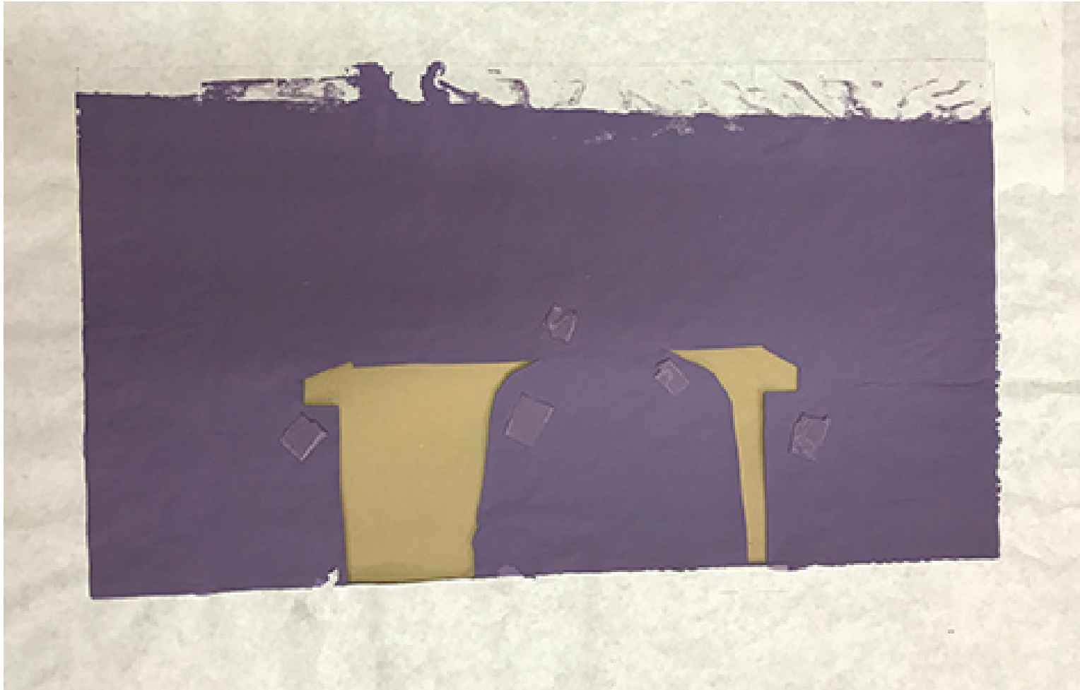
A used paper stencil that has been printed over in purple ink.