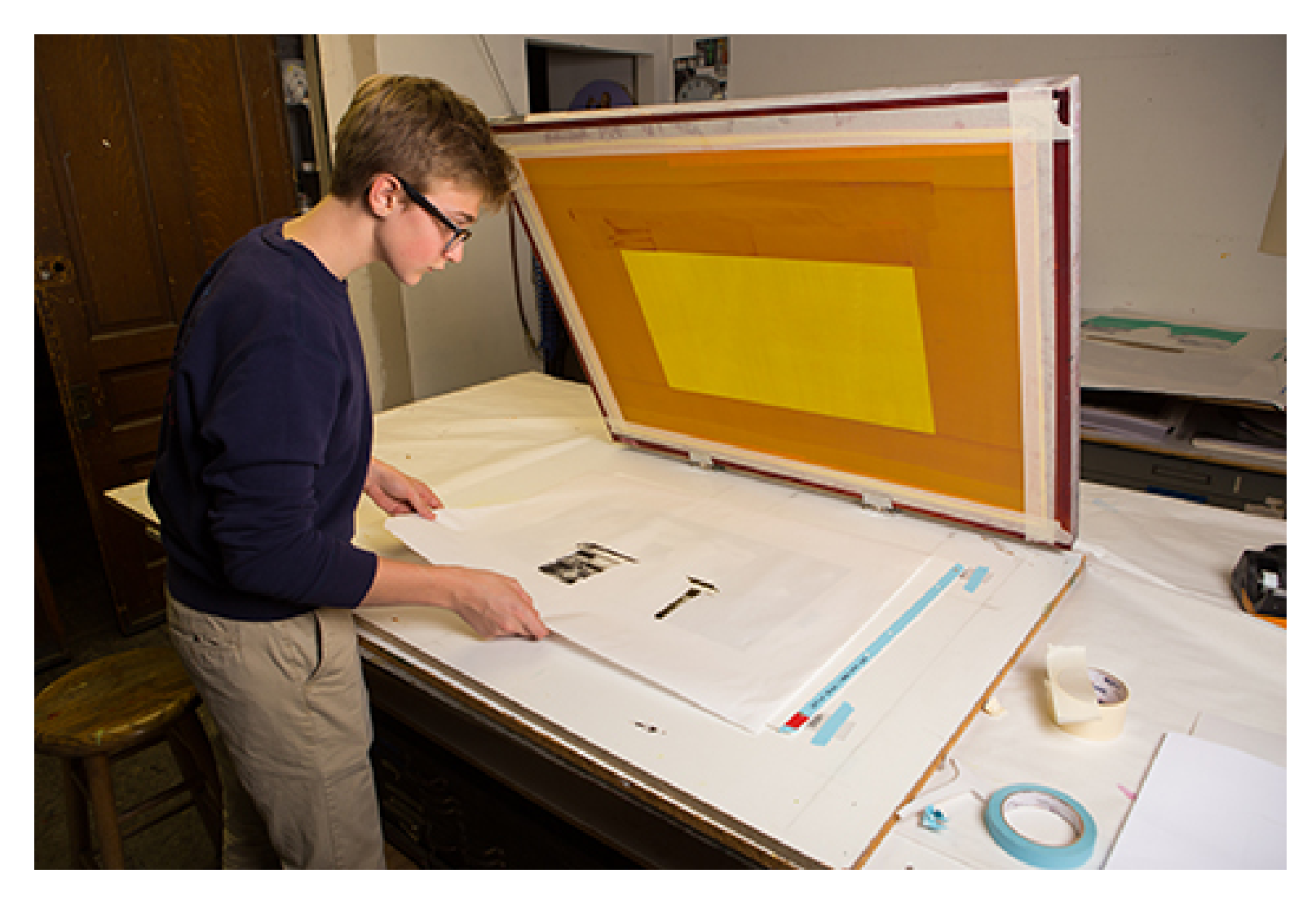
Student checking the alignment of their stencil underneath silkscreen.