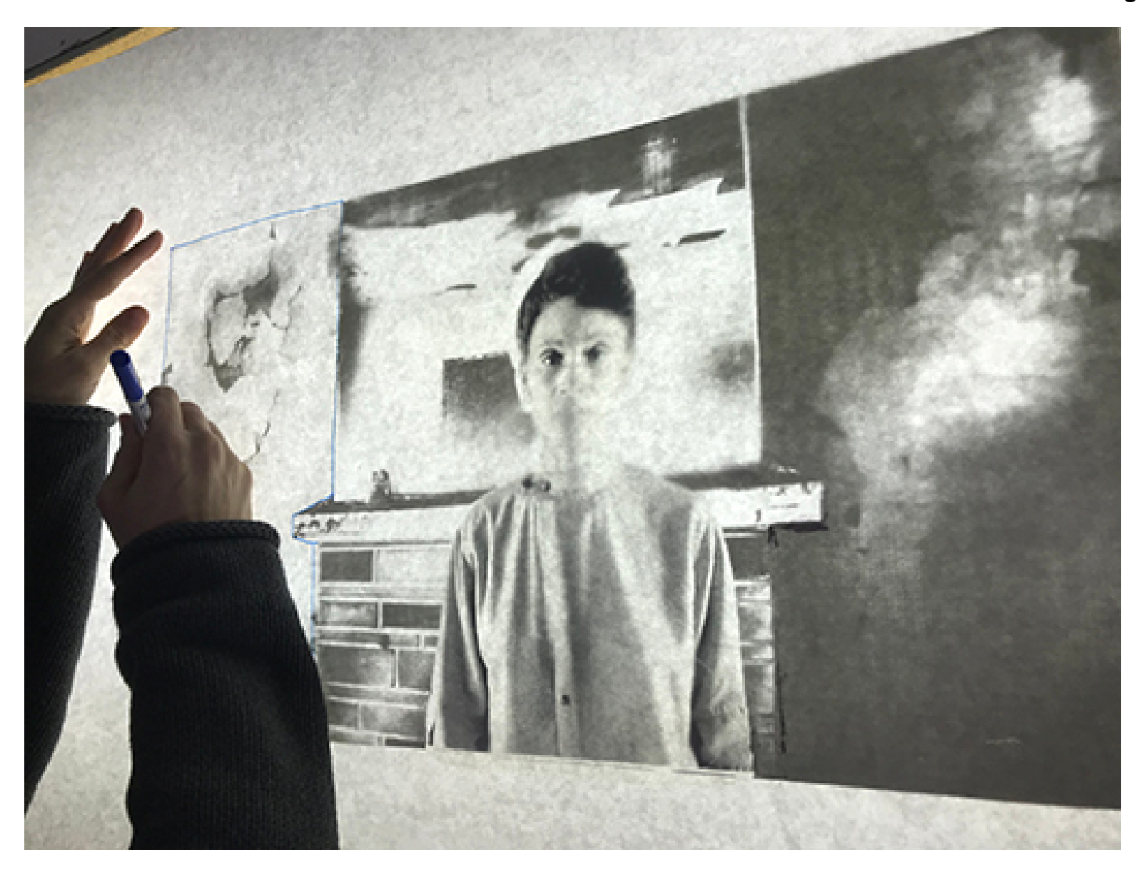
Student using a film positive to trace outlines for their first stencil.

© The Andy Warhol Museum, one of the four Carnegie Museums of Pittsburgh. All rights reserved. You may view and download the materials posted in this site for personal, informational, educational and non-commercial use only. The contents of this site may not be reproduced in any form beyond its original intent without the permission of The Andy Warhol Museum. except where noted, ownership of all material is The Andy Warhol Museum, Pittsburgh; Founding Collection, Contribution The Andy Warhol Foundation for the Visual Arts, Inc.